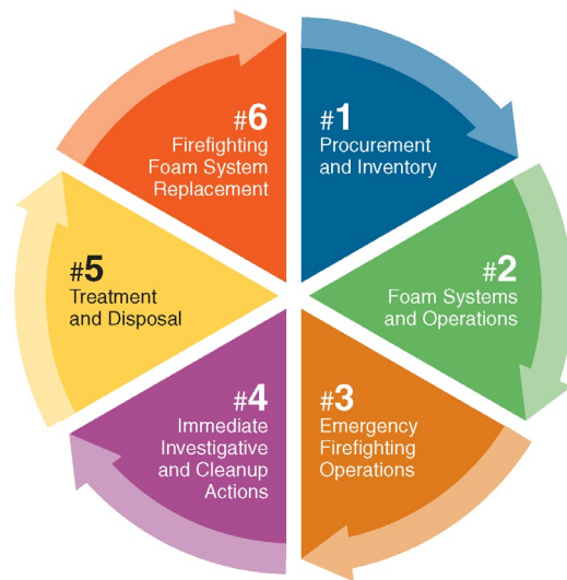
Figure 3. Life cycle considerations for AFFF.

Firefighting foam replacement is complex and could require a complete system review and, potentially, redesign and modification of system components to meet the new objectives or material and performance requirements. Foam replacement should include an evaluation of specific hazards and application objectives, a review of applicable performance standards, an understanding of engineering requirements for foam product storage and application, and a check to ensure that the foam product is approved for use for the specific hazards being mitigated.